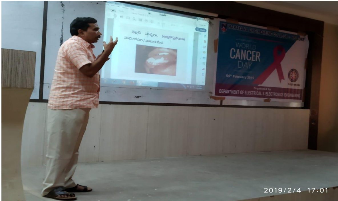
Doctor explaining the consequences of Cancer on World Cancer Day