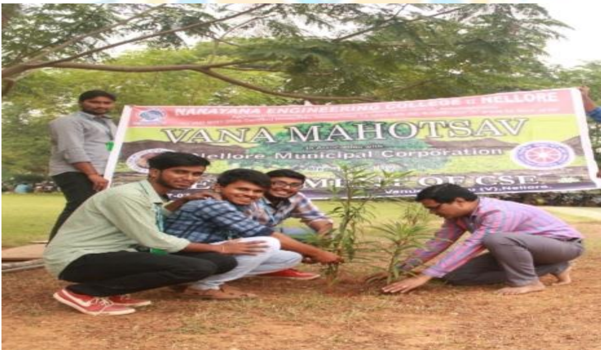
Staff and Students planting Saplings on the eve of Vana Mahotsav