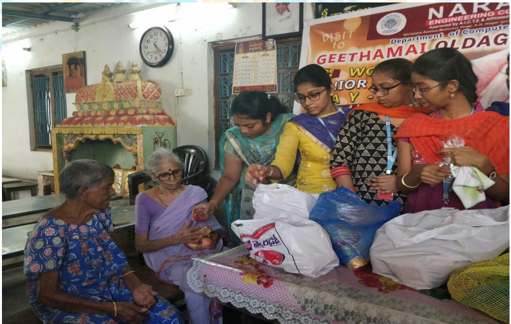
Students Distributing Fruits to the inmates of Gita Mayee Old age Home, Nellore