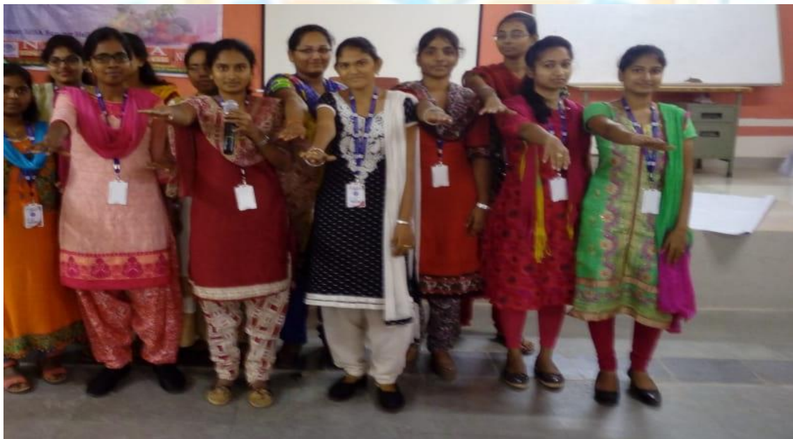
Students taking Pledge on National Solidarity Day