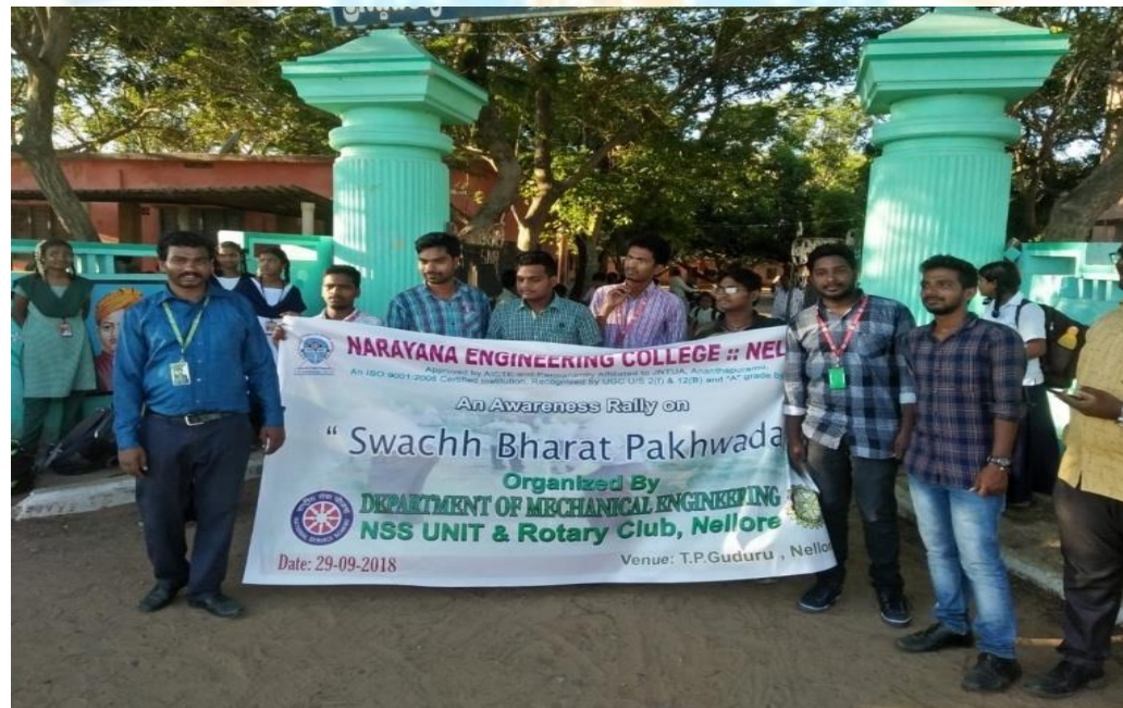
Swachh Bharat Pakhwada Rally at TP Gudur, Nellore