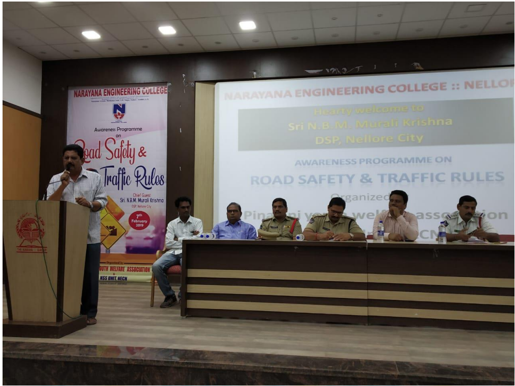
Chief Guest addressing the gathering