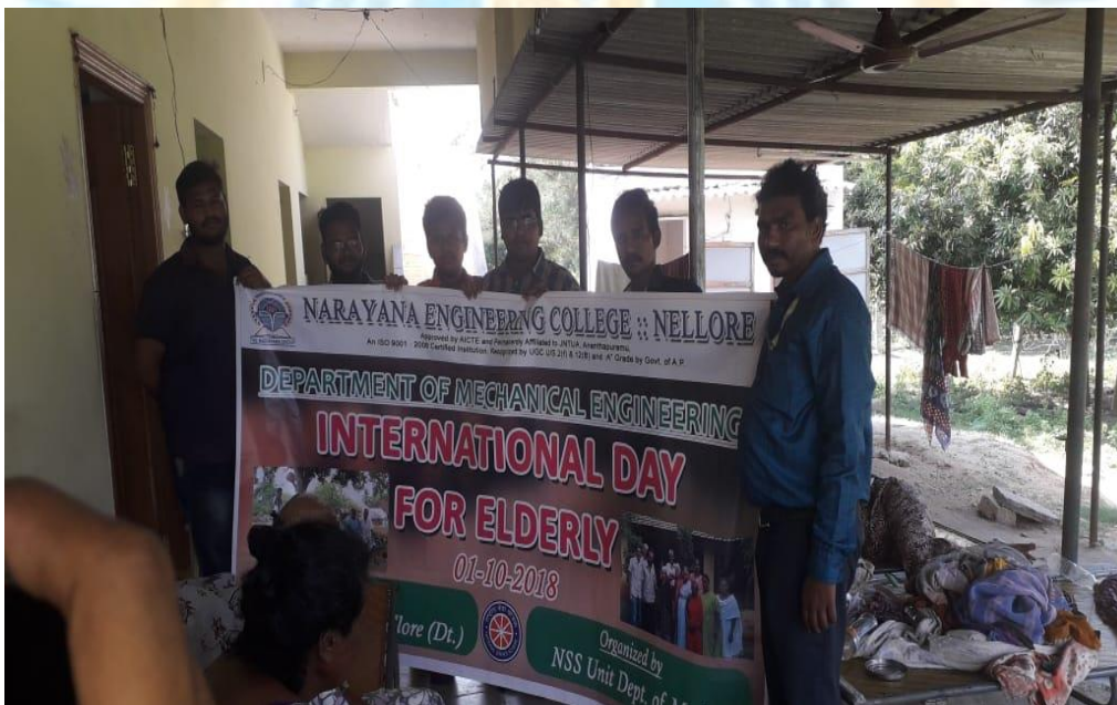
Staff and Students at Vanaprasthanam Old age Home, Kothuru Village, Nellore