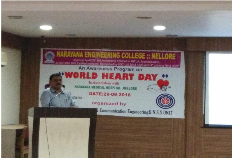
Doctor explaining the importance of World Heart Day at NECN