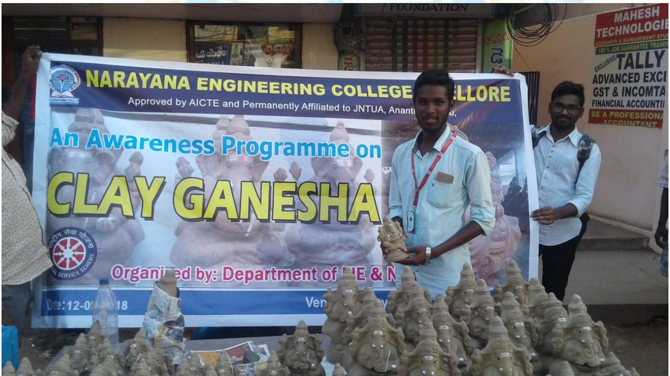
Clay Ganesh Idols prepared by Students of NECN