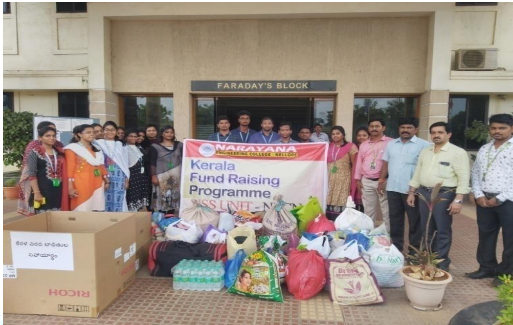
Funds collected from Staff and Students of NECN