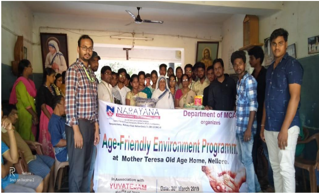
Staff and Students visit to Mother Teresa Old Age Home, Nellore