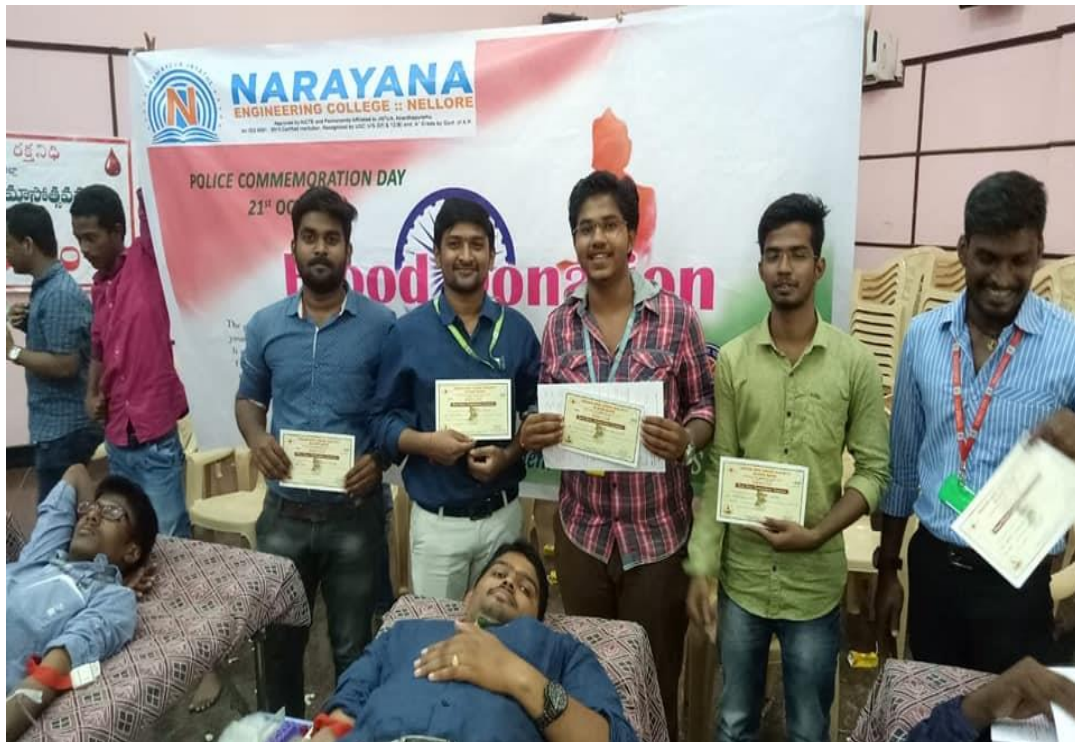
Staff and Students of NECN donating Blood on Police Commemoration Day