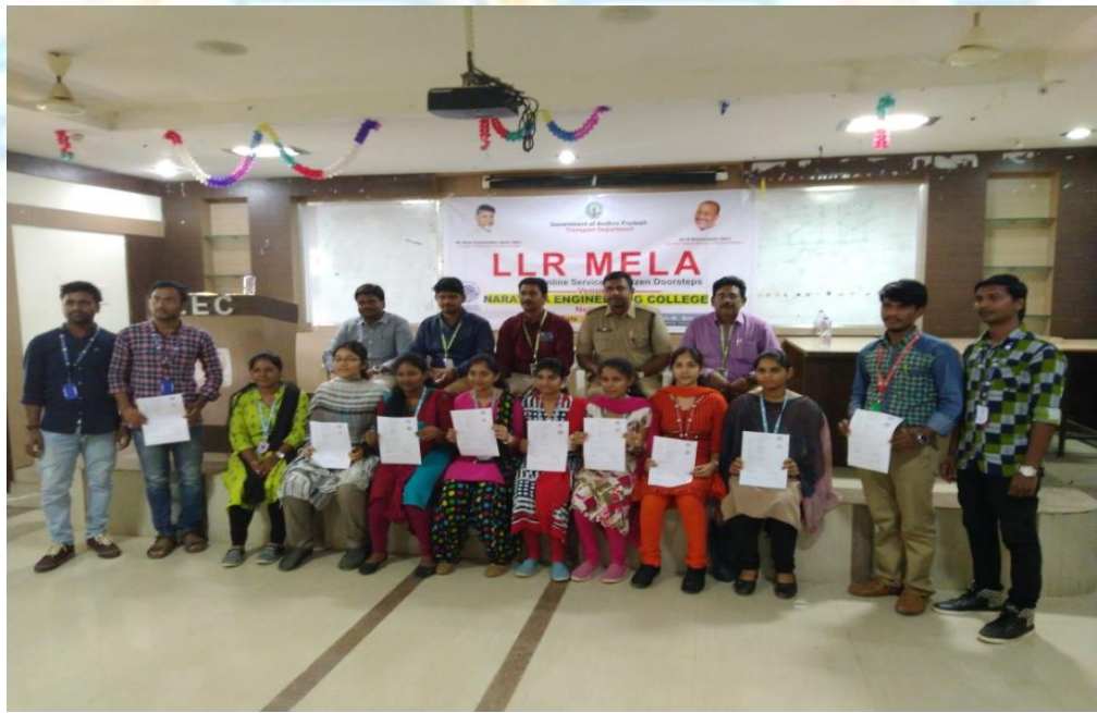
LLR Copies Distributed to the students after qualifying the LLR test