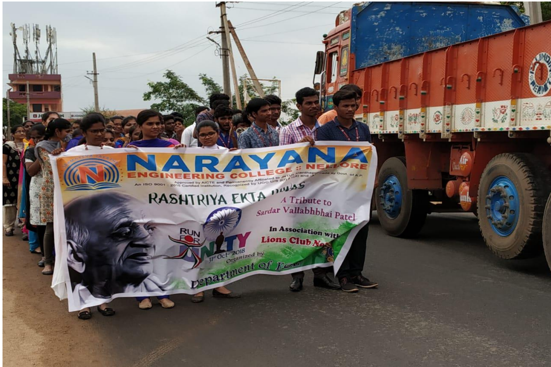
Awareness Rally on Rastriya Ektha Diwas