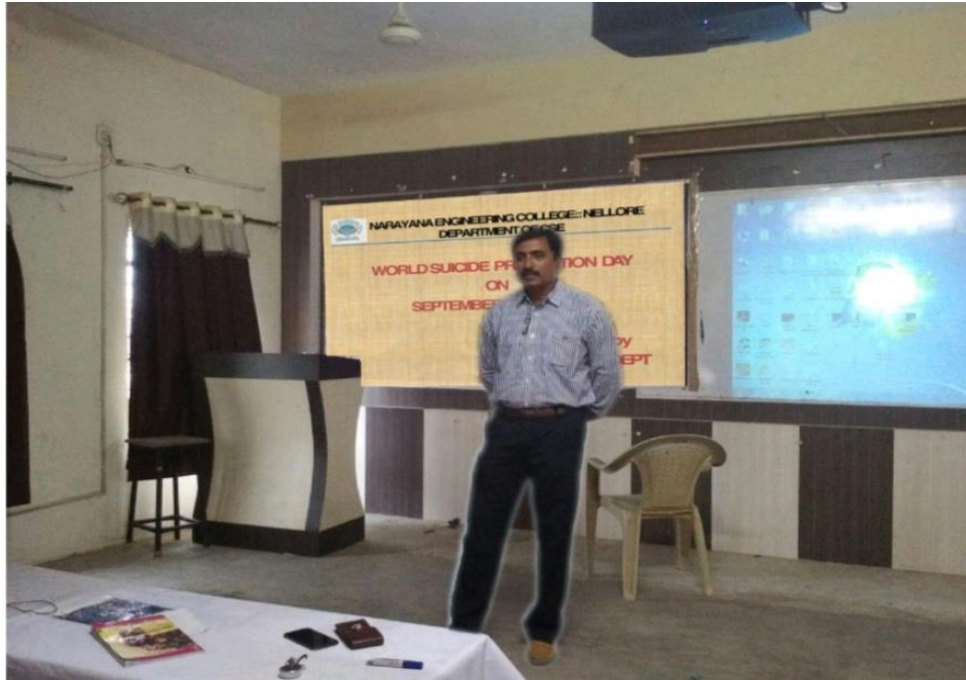
Mr.A.Prasad explaining the preventive measures to be taken to control Suicides