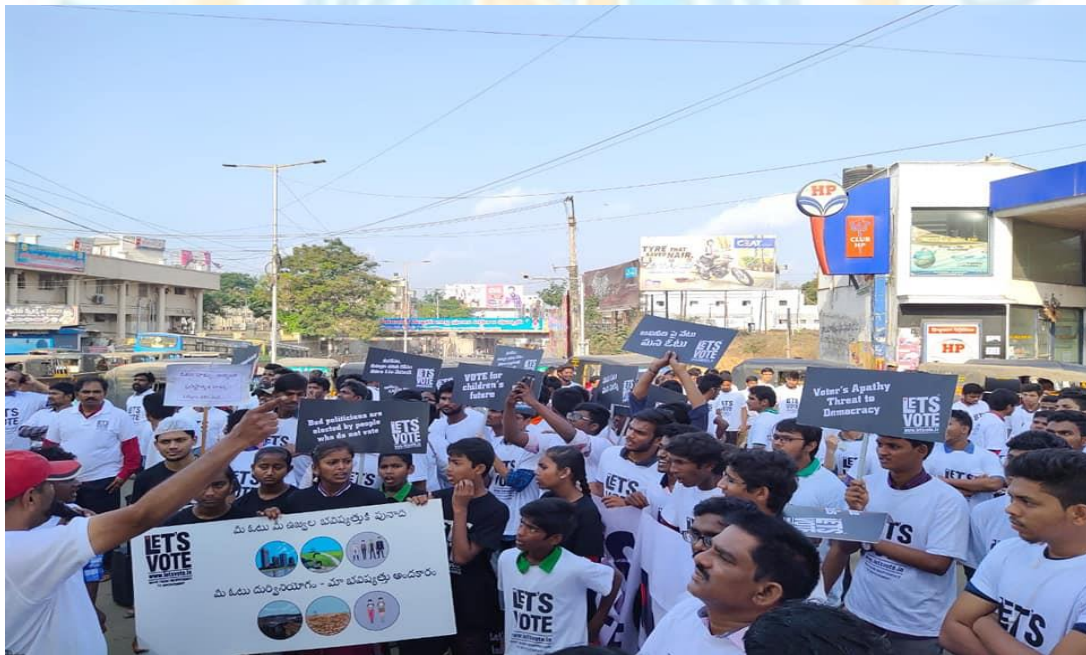
Staff and Students of NECN at Voter Awareness Rally