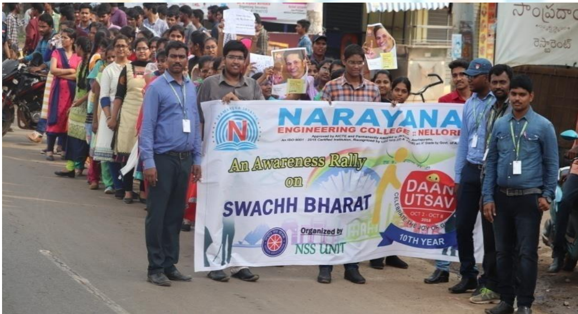
Staff and students at Awareness Rally on Swachh Bharat