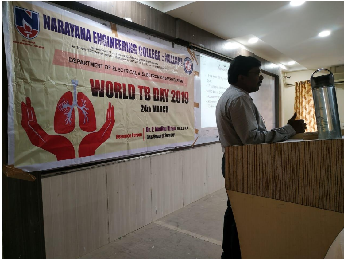
Awareness Program on TB on World TB Day