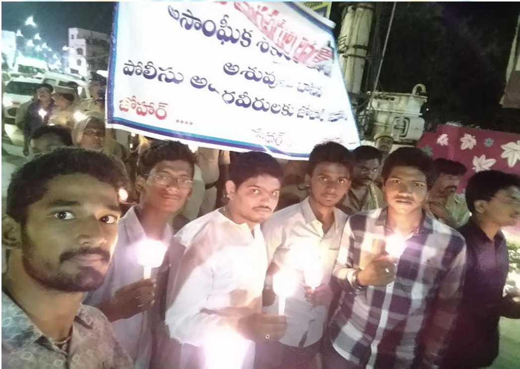
Candle Rally on the eve of Police Commemoration Day